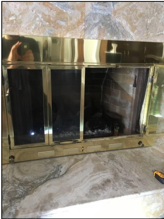
7. Damper in existing fireplace not fixed open