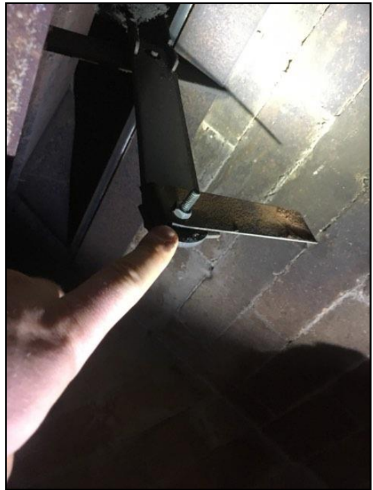
8. Damper in existing fireplace not fixed open